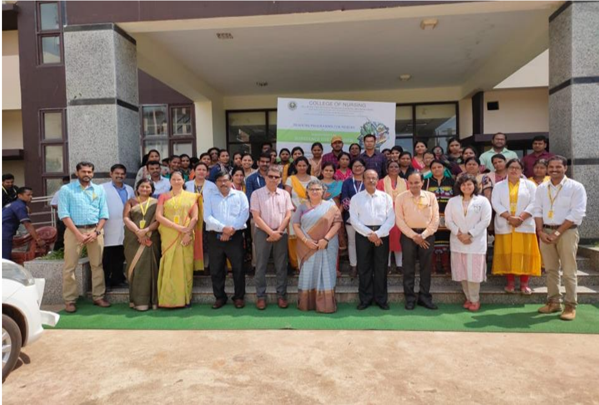
Delegates and Organizers with Director AIIMS, Bhubaneswar, Director Nursing Odisha, DDA, Medical Superintendent, AIIMS, HOD Dept. of Psychiatry, AIIMS.